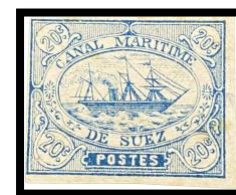
'Spiro' 1880. forged stamp. Type I & III