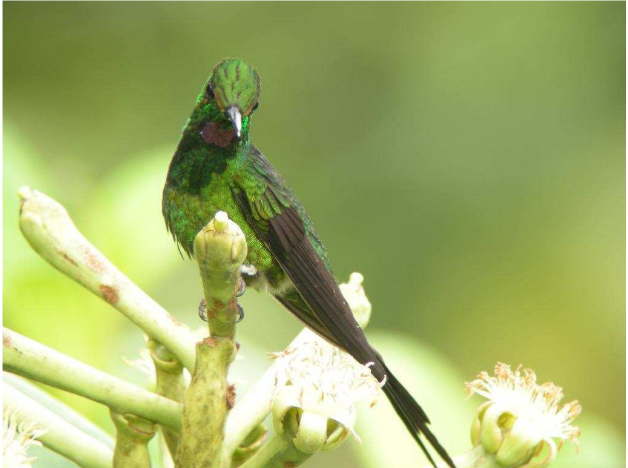
Empress Brilliant © 2008 Jurgen Beckers